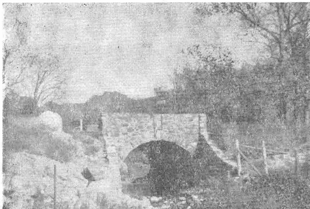
The New Multi-Plate Steel Arch Bridge on Scantic Road

We, of the Highway Department, feel that much has been accomplished in road and street improvements during 1949. We did not have the heavy snows to plow last winter and, therefore, saved some money on that account. However, it costs considerable to plow the light snowfalls of last winter as the same area has to be covered and plow blades wear out faster than when we have long continued cold weather with hard snow and ice on the road surface.