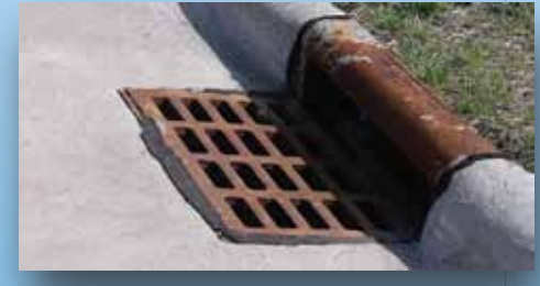
Storm Drain / Catch Basin

The storm drain system, on the other hand,