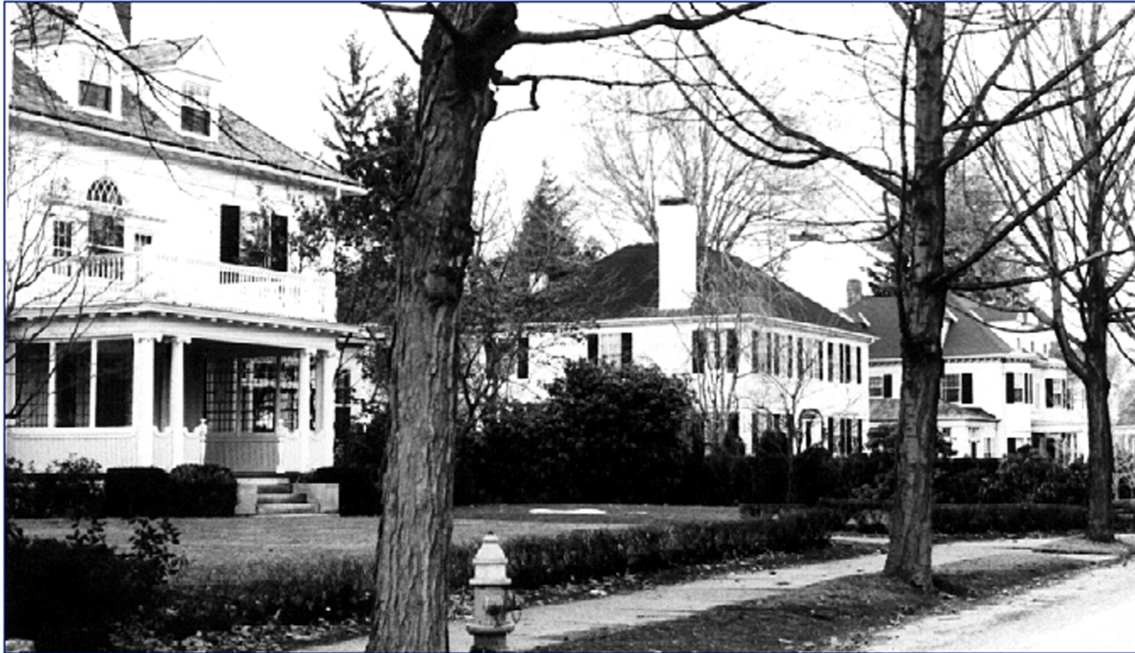
Massachusetts Avenue Historic District, Worcester, both a Local and National Register Historic District

Can a property be designated both as part of a National Register District and as a part of a Local Historic District?